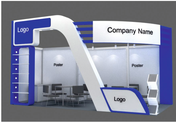
Design 4: 170/m 2

*The package includes 2 KW power supply per 18 m 2 .