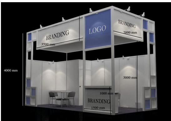
Design 3: 105/m 2

* The package includes 2 KW power supply per 12 m 2 .